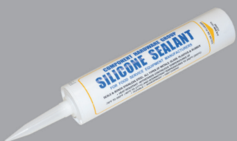
M90 Food Grade Silicone Sealant