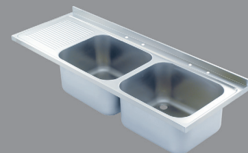
Wide Range of Sink Tops

For more information on any of our products, please contact our customer service team on 01327 311144 or sales@die-pat.co.uk www.die-pat.co.uk